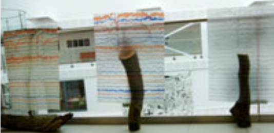
Frith Lawson-Johnson, 'Triptic', 2015. Mixed media, fabric, wood, and driftwood. Dimensions: 100 x 100 x 100 cm.