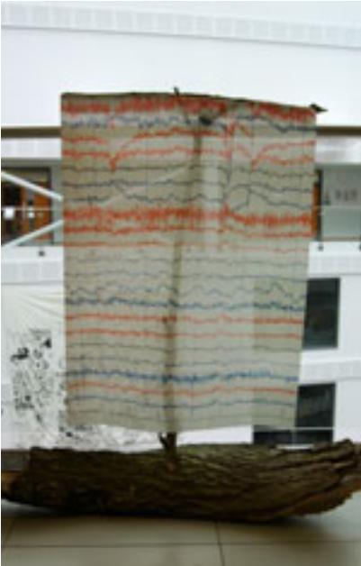
Frith Lawson-Johnson, 'Triptic', 2015. Mixed media, fabric, wood, and driftwood. Dimensions: 100 x 100 x 100 cm.