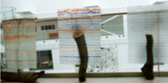
Frith Lawson-Johnson, 'Triptic', 2015. Mixed media, fabric, wood, and driftwood. Dimensions: 100 x 100 x 100 cm.